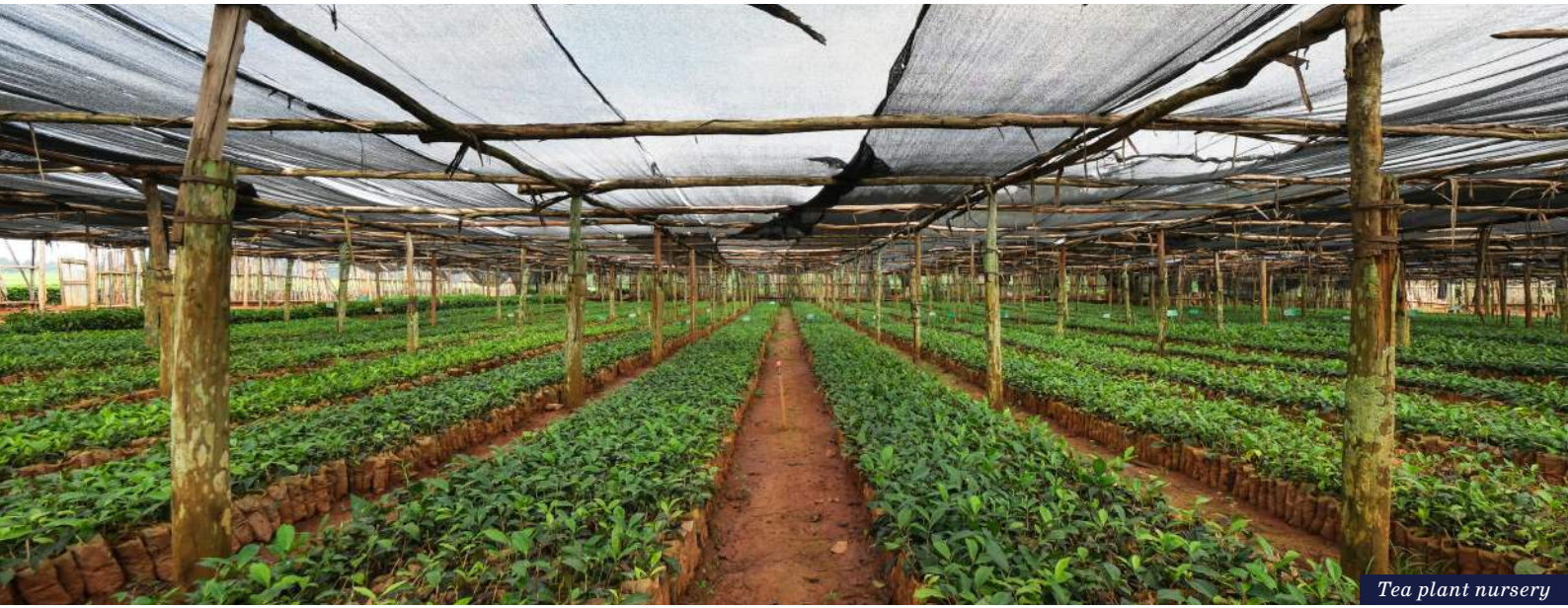
Tea plant nursery

Over the last decade alone our Foundation has achieved the following;