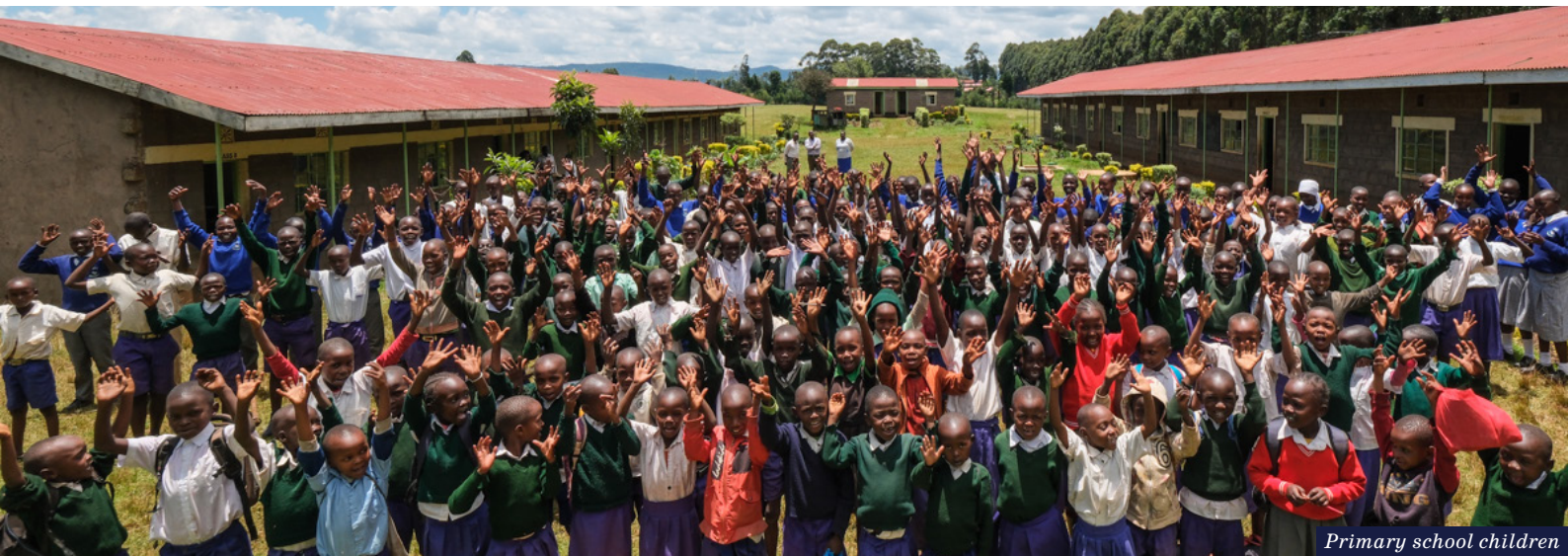
Primary school children

As a public limited company representing thousands of shareholders and stakeholders throughout Kenya and the Williamson Tea Foundation ensures that every cup of Williamson Tea helps sustain our farms and communities for generations to come.