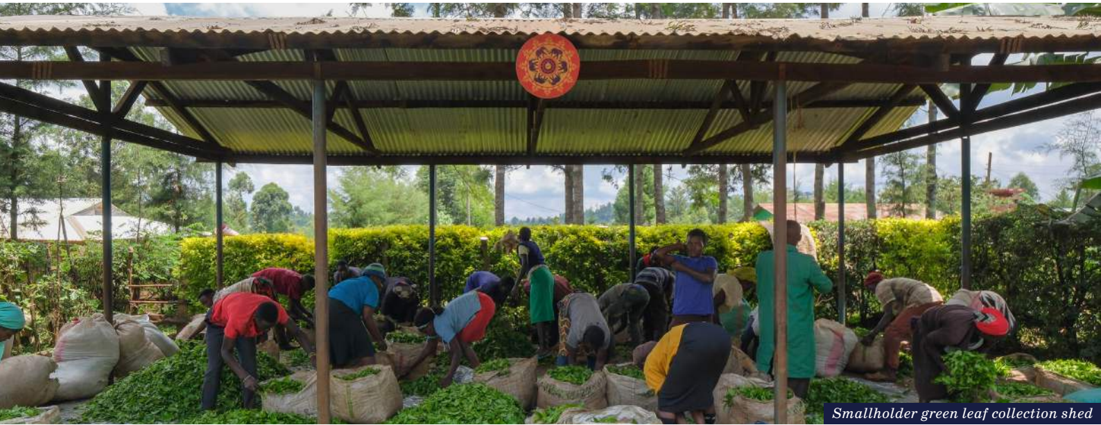
Smallholder green leaf collection shed

The Williamson Tea Foundation's focus has traditionally been on education and health care and over the years we have provided schools, clinics and other amenities to the many thousands of families that call our farms home so that they can continue to prosper.